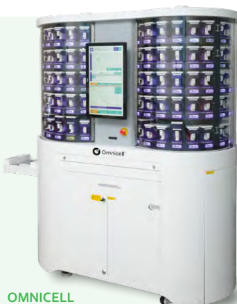
OMNICELL VBM 200F