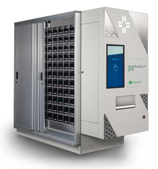
THE COMPACT AND MULTI PHARMASELF24 MODELS